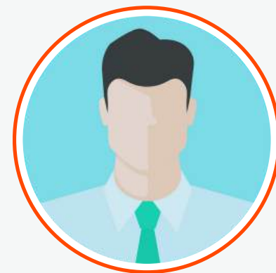
Business Development Specialist